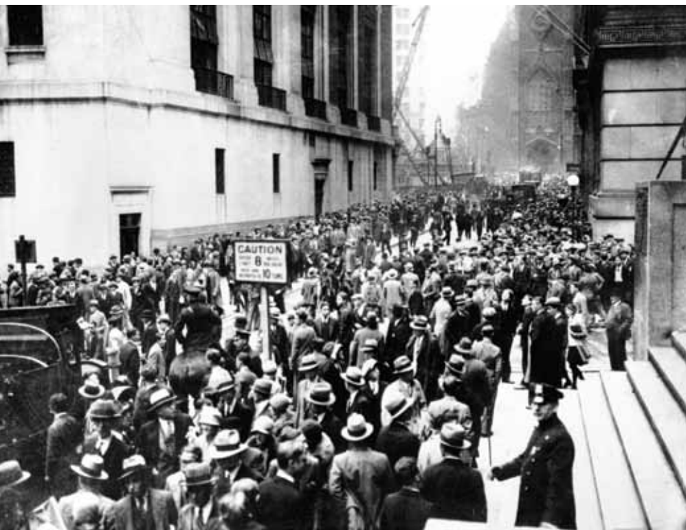
"Black Thursday": There was panic on Wall Street and elsewhere in the country when the stock market "crashed" on October 24, 1929.

One aspect of the New Deal that has been largely forgotten in our time is that one of President Roosevelt's first acts in 1933 was to ban the private possession of gold. Paper dollars were no longer redeemable in gold, and what gold people possessed was contraband, with the legal requirement that it be exchanged