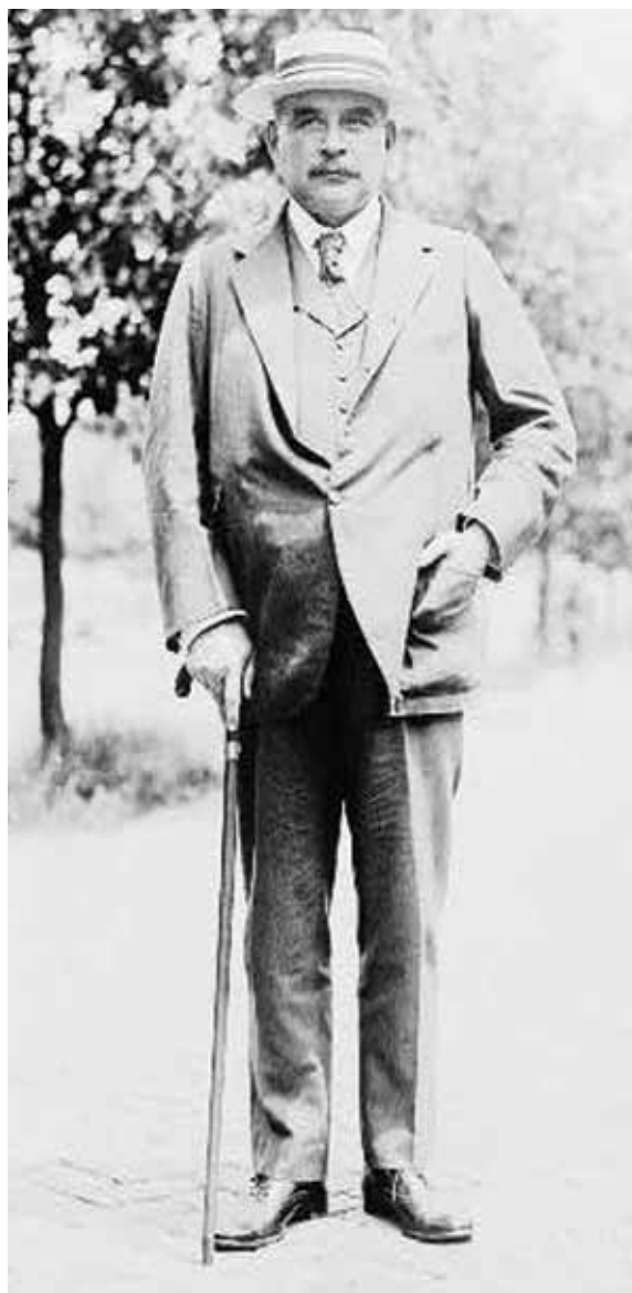
J.P. Morgan, Jr. was heir to the financial empire known as the "House of Morgan" and a founding member of the Council on Foreign Relations.

Benjamin Strong, head of the Federal Reserve Bank of New York, held frequent meetings throughout the 1920s with Montagu Norman, governor of the Bank of England. The Bank of England provided Strong with a private office and a secretary during his frequent visits to London. The heads of the central banks of France