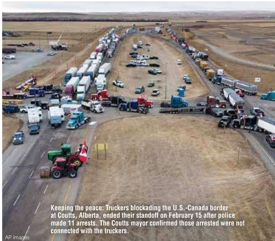
Keeping the peace: Truckers blockading the U.S.-Canada border at Coutts, Alberta, ended their standoff on February 15 after police made 11 arrests. The Coutts mayor confirmed those arrested were not connected with the truckers.

Meanwhile, a malicious propaganda campaign rages against the truckers. The ninth day of protest saw Ottawa’s mayor declare a state of emergency, appealing by letter to federal and provincial authorities for 1,800 additional policemen to buttress his force, who supposedly could not “quell the insurrection” alone. The smokescreen appeal echoed a lie circulating among government officials and major media implying that the truckers are riotous criminals. CTV News quoted Ottawa Police Service (OPS) chief