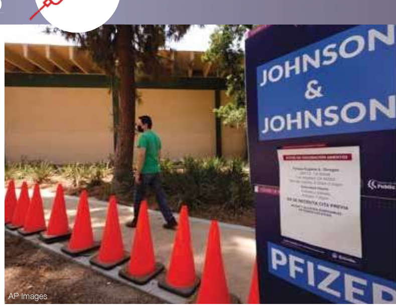
Untested & experimental: Despite mandates, there are no third-party, unbiased safety studies of COVID-19 vaccines, and health authorities appear to ignore more than 500,000 adverse events reported to the CDC so far.

When it comes to safety, our primary metric is after-the-fact. CDC's Vaccine Adverse Event Reporting System (VAERS), which collects information about side effects, logged nearly 12,000 deaths from mid-December through July 23.