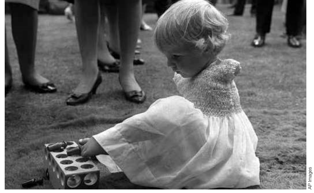
A new thalidomide? In the late 1950s, thalidomide was touted as a safe and effective means of reducing morning sickness during pregnancy, among other uses. It caused severe birth defects. Are we seeing a similar situation with the COVID-19 vaccines with their various side effects?

"I'm here to tell you that there is something very, very bad happening. If you don't pay attention, you will soon lose any chance to do anything about it," and "Look out the window, and think, 'Why is my government lying to me about something so fundamental?' Because, I think the answer is, they are