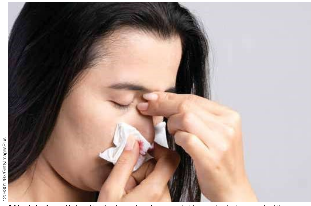
A bloody business: Various bleeding issues have been reported by people who have received the COVID-19 shots. Some of the bleeding has been severe, even fatal. Is it worth the risk?

In truth, neither COVID "vaccine" recipients nor their doctors know what is in these shots. Only a few people at the top of the Moderna, Pfizer, Johnson & Johnson, and AstraZeneca research groups really understand them.