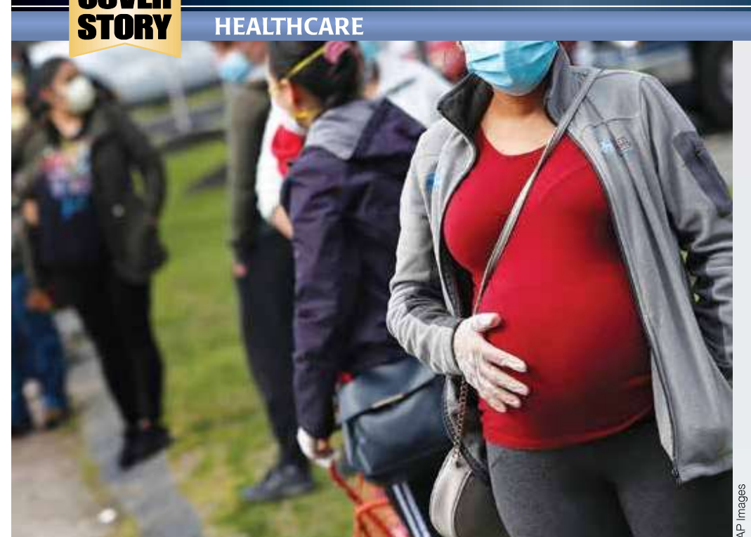
High risk: There is strong evidence to suggest that COVID-19 vaccines can cause harm to women's reproductive systems, either directly or via "shedding" from other vaccinated individuals.

teria-Based Gene Therapy and Oncolytic Products — Guidance for Industry." The paper, which was written for pharmaceutical researchers, states in the introduction, "Shedding raises the possibility of transmission of VBGT or oncolytic products from treated to untreated individuals (e.g., close contacts and healthcare professionals)." And just to make sure that researchers knew they would not be prosecuted, the FDA kindly added, "FDA's guidance documents, including this guidance, do not establish legally enforceable responsibilities." Lovely.