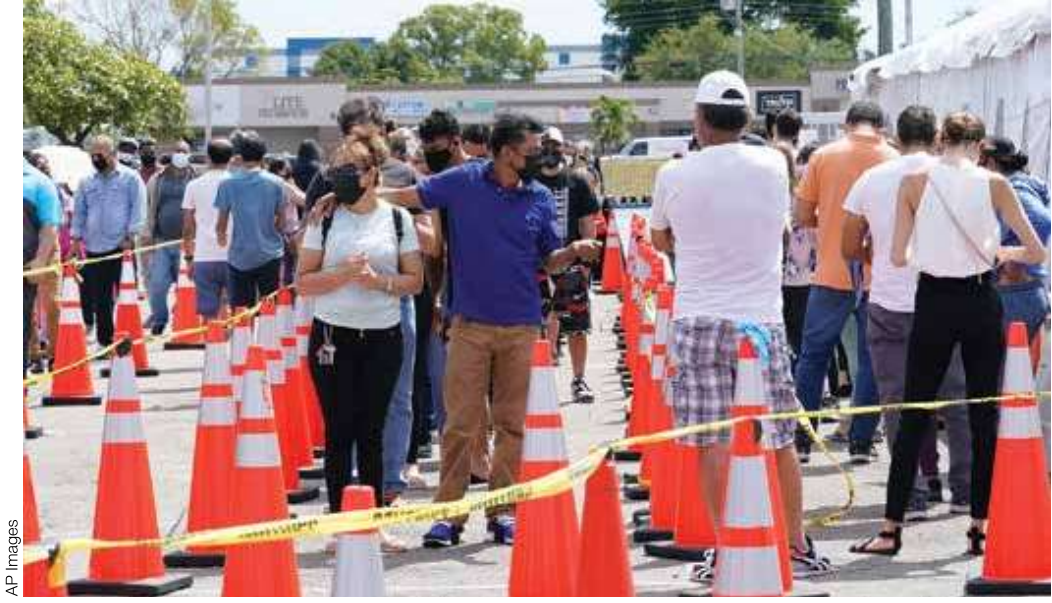
Get your vaccines: While many Americans have already received their COVID-19 vaccines, many remain skeptical about the safety and effectiveness of the shot despite massive amounts of government and media propaganda aimed at reducing "vaccine hesitancy."

Many people who wouldn't purchase the first edition of a new car model are lining up to take an injection they know nothing about ... that could never meet the required "safety level" for a "drug," and that is unapproved for the prevention of COVID except as an emergency experiment.