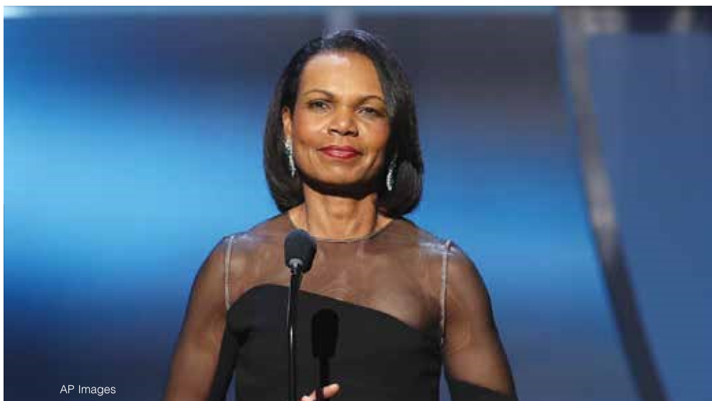
Reduced to repulsive smears: Council on Foreign Relations member Condoleezza Rice, who helped lie America into illegal wars under George W. Bush, is the latest establishment globalist to dishonestly smear The John Birch Society.