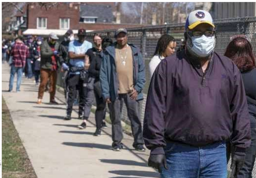
Scared for nothing: Despite a barrage of scaremongering, Wisconsin held its primary elections as scheduled by law on April 7. A study afterward showed no increase in COVID-19 new-case daily rates in Wisconsin compared to the United States as a whole.

Lasky emphasized that not all precinct captains engaged in such operations, but the point is that it is possible and that it has been done. And probably most important-