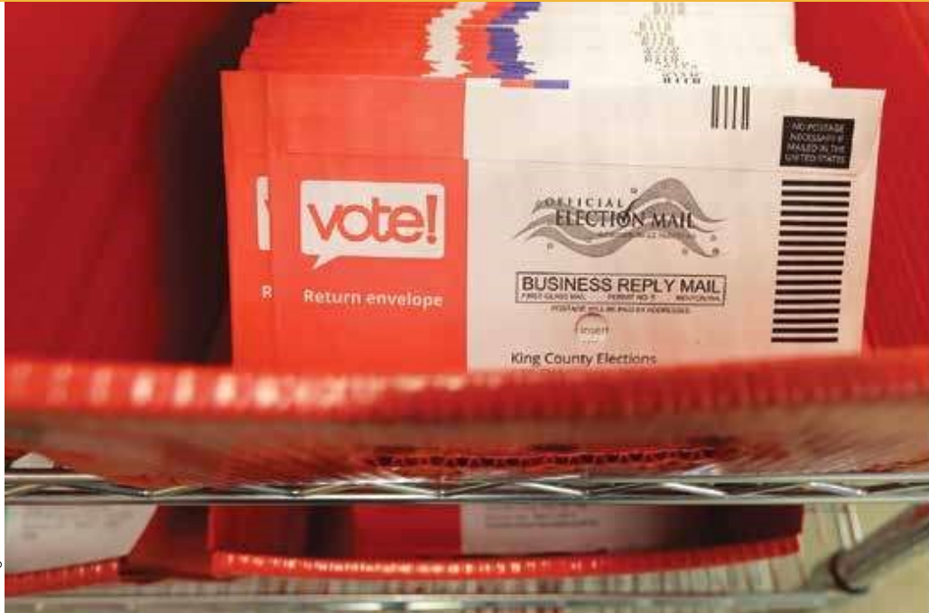
Time to cheat: Mail-in ballots by the box load, with little or no monitoring by the public, sit idly in post offices or in bins before and after being filled out by voters, leaving the ballots to be altered or stolen. In Nevada, mail-in ballots were found in large stacks outside apartment buildings.

Almost universally we found the persons immediately responsible for many of said election frauds to be men holding elective offices and men holding responsible subordinate positions in the service of elected or appointed County Officials and of course paid by the taxpayers. Out of such facts grow the creation and