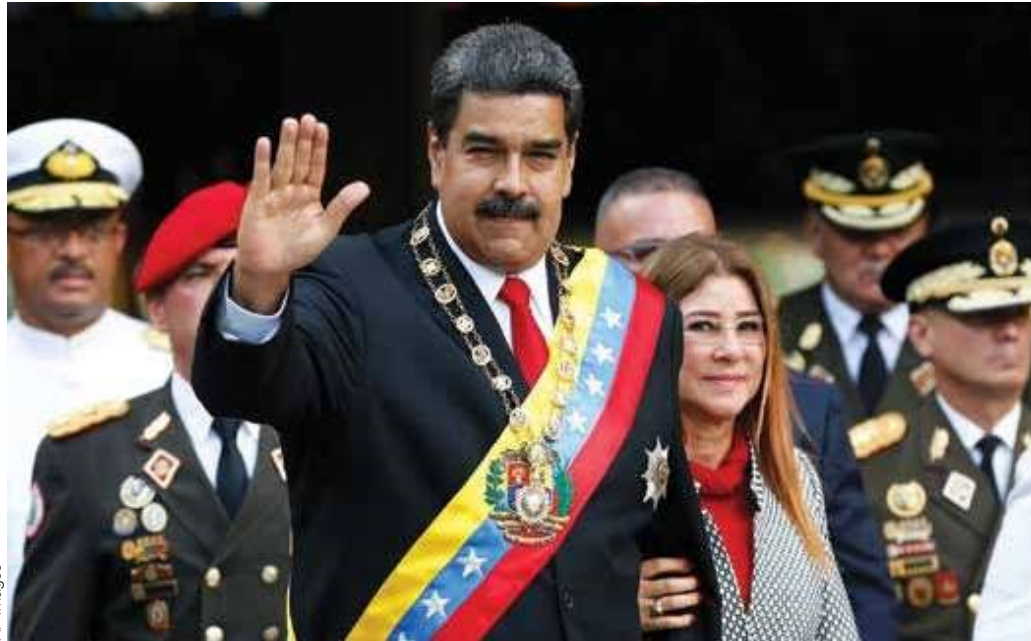
Election fraud — here, there, everywhere: Despite many nations refusing to recognize the legitimacy of Nicolás Maduro's reelection, Maduro claims he won handily.

The United States is on the cusp of literally throwing all the safeguards out the window and declaring vote fraud OK — all in the name of equality and fairness. This movement is mainly being pushed by Democrats, and it has gained momentum with the coronavirus shutdowns.