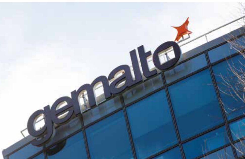
Gemalto: Now a division of French security firm Thales Group, Gemalto is one corporate entity working to build the infrastructure for a digital ID. The company has noted in its literature that without a future digital ID, “conducting many daily activities could be hampered.”

Credible but also creditably disputed claims, especially in Kenya, that some Gates-related vaccines intervened in human reproduction aside, Gates and his organization are interested in population control. Their work for a decade or more on tying vaccination to identification is clearly part of this agenda. Even tak-