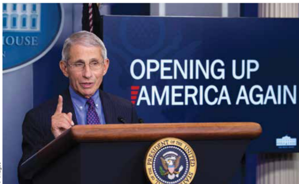
Dr. Anthony Fauci: A key member of President Trump's coronavirus task force, Dr. Fauci has speculated that Americans will need to have immunity cards to prove they are virus-free before they can regain some of their lost freedoms.