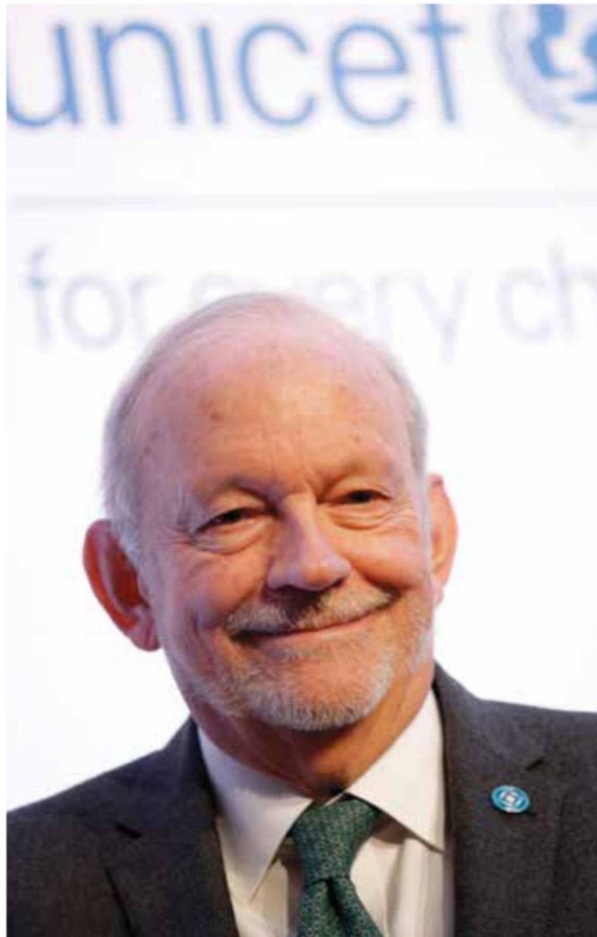
Anthony Lake: A Clinton administration bureaucrat, Lake participated in the leadership council of the World Health Organization's Global Vaccine Action Plan, which was a joint operation with the Bill & Melinda Gates Foundation. Joining Lake on the leadership council were Margaret Chan and Anthony Fauci.

That last bit is promoted by those behind the digital ID