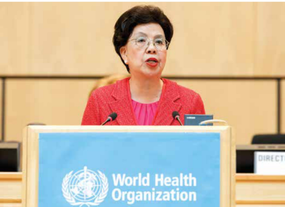
Margaret Chan: Former head of the World Health Organization, Chan now leads the Global Health Forum, an organization dedicated to achieving the goals put forth by the UN's 2030 Agenda for Sustainable Development. Among those goals: providing "legal identity for all, including birth registration."

In its documentation, the World Health Organization's Global Vaccine Action Plan, led by Chan and Fauci, called for numerous steps, including the use of ID technologies to track those vaccinated. According to the Global Vaccine Action Plan 2011-2020 summary available as a PDF from WHO: "Reaching every community will call for an understanding of the barriers to access and use of immunization; it will also require the underserved to be identified, and micro-plans at the district and community levels to be reviewed and revised in order to ensure that these barriers can be overcome. The rapid expansion of information technology should be leveraged to establish immunization registries and electronic da-