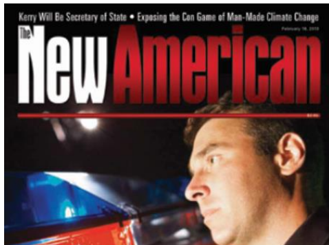
The New American magazine February 18, 2013