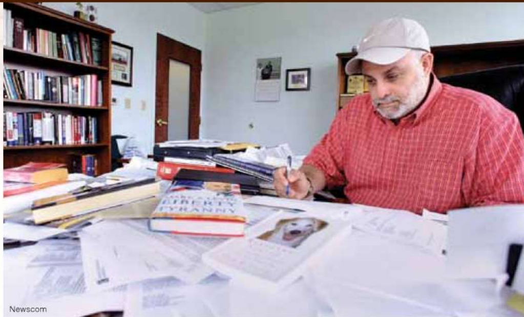
Mark Levin , popular conservative radio talk-show host and author of the best-selling book The Liberty Amendments , works in his office in Leesburg, Virginia. Levin was formerly skeptical of an Article V constitutional convention, but now believes the requirement for ratification by three-fourths of the states is a “serious check” against a runaway convention.

Take a careful look at this passage in the early portion of the Declaration of Independence: