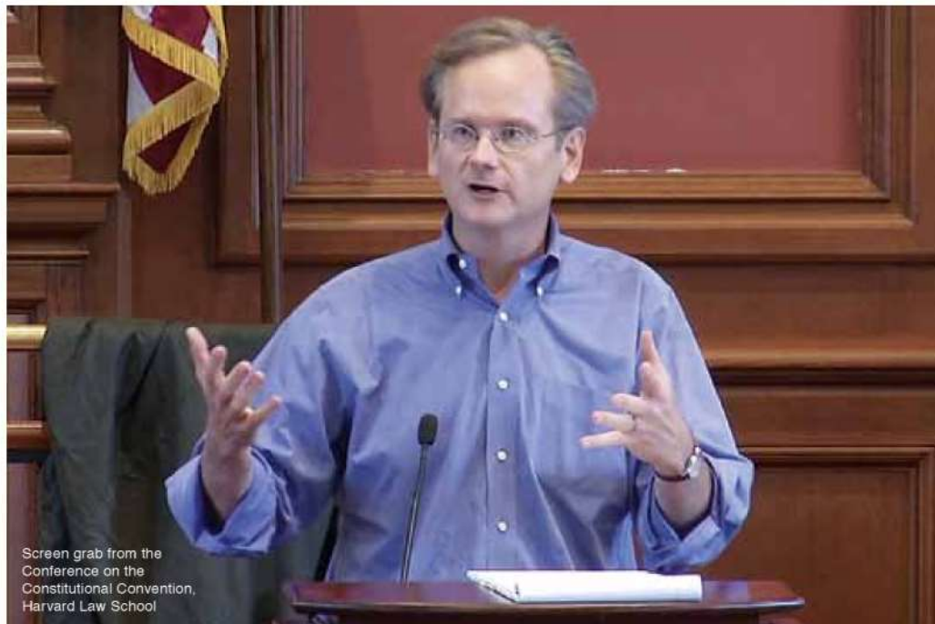
Screen grab from the Conference on the Constitutional Convention, Harvard Law School

While pro-Article V convention enthusiasts tell us that this is a great time for an Article V convention because the Republican Party controls 26 of the 50 state legislatures (the Democrats control 18, five are split, and one is non-partisan), and therefore could surely block the ratification of any harmful amendments proposed by an Article V convention, they are omitting from this analysis that very many of the Republican state legislators are not constitutionalists, and could end up in alliance with Democrats to ratify some harmful amendments. Not to mention the