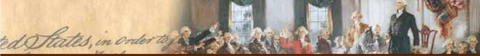
The signing of the U.S. Constitution at the Constitutional Convention of 1787 was depicted in this 1856 painting by Junius Brutus Stearns. Constitutionalists can agree that Levin is accurately describing our problems with the federal government; however, many constitutionalists will also agree that Levin is encouraging Americans to play with fire by promoting a constitutional convention.

likelihood that constitutionalists would be in the minority at the convention for proposing amendments itself.