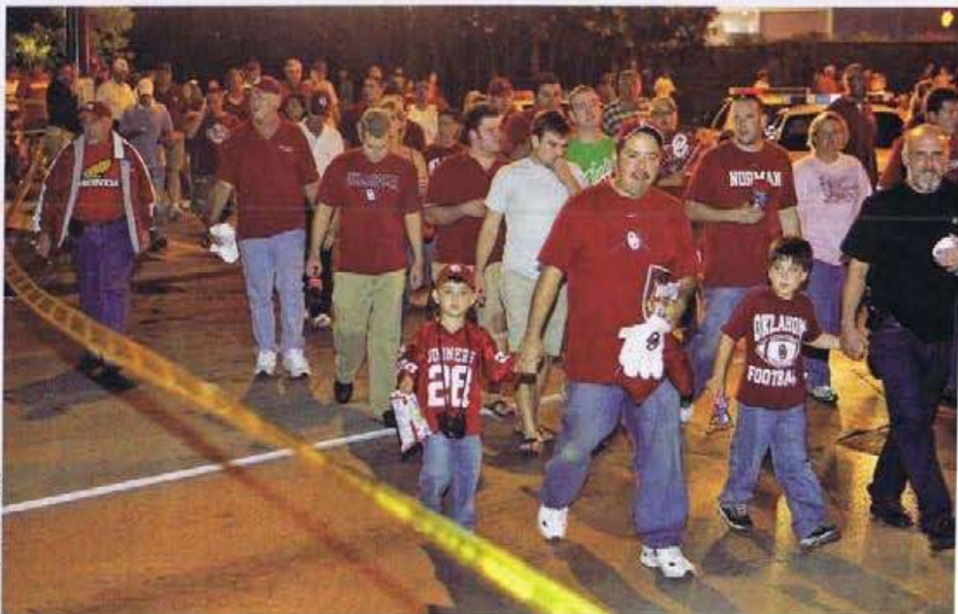
Thousands of fans the intended target? Football fans walk past police perimeter tape after an apparent suicide bomber blew himself up outside the packed stadium at the University of Oklahoma on October 1.