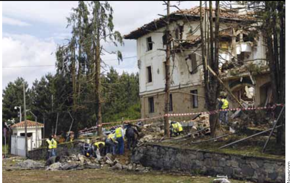
A car bomb blast outside a Guardia Civil barracks in Legutiano, Spain, on May 14, 2008, killed one Guardia Civil policeman and injured another four.

Between 1968 and 1978, when I broke with Communism, the security forces of Romania alone sent two cargo planes full of military goodies every week to Palestinian terrorists in Lebanon. Since the fall of Communism the East German Stasi archives have revealed that, in 1983 alone, its foreign intelligence service sent $1,877,600 worth of AK-47 ammunition to Lebanon. According to Vaclav Havel, Communist Czechoslovakia shipped 1,000 tons of the odorless explosive Semtex-H (which can’t be detected by sniffer dogs) to Islamic terrorists — enough for 150 years.