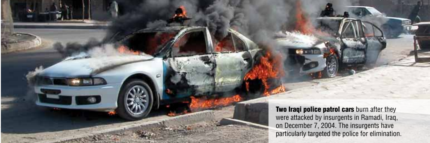
Two Iraqi police patrol cars burn after they were attacked by insurgents in Ramadi, Iraq, on December 7, 2004. The insurgents have particularly targeted the police for elimination.

The global terror network launched by the Soviet KGB in the 1960s, now dressed in jihadist garb, continues a decades-long war against law enforcement in the non-communist world.