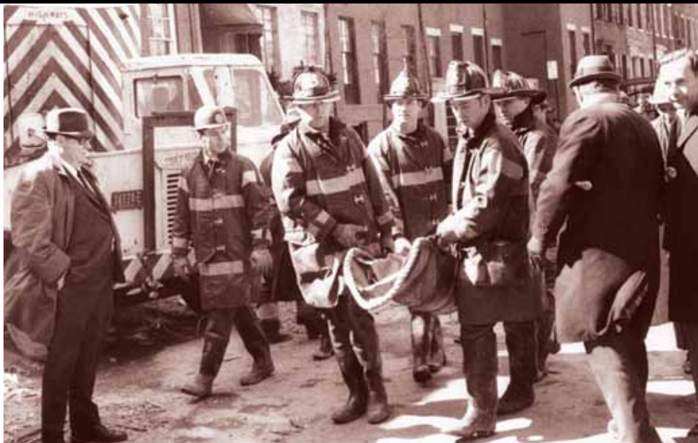
New York City firemen remove parts of a woman's body recovered from a Greenwich Village townhouse destroyed by an explosion on March 6, 1970. Three members of the Weatherman terrorist group were killed in the blast while making bombs to be used against U.S. soldiers attending a dance at Fort Dix, N.J.

The Communists had a crew sweep through the city ahead of the mob, smashing off locks and opening stores and warehouses. After the mob had looted the buildings, another crew went through spraying gasoline on floors and walls. The last stage was to have trained arsonists methodically burn these structures which ultimately destroyed the center of the city. Colleges, churches, stores and other public buildings were burned. Altogether, 136 major buildings were destroyed.... After the