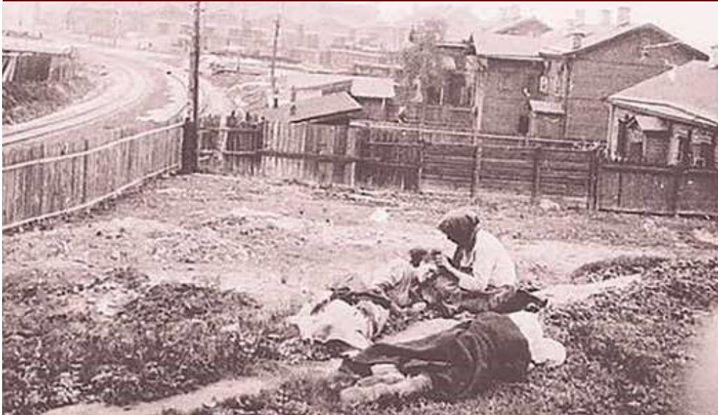
The terror famine: During the “Holodomor” — Ukrainian for murder by hunger — as many as 10 million or more Ukrainians were starved to death in 1932-33 by Soviet dictator Joseph Stalin’s communist regime.

Times and its “Man in Moscow,” Walter Duranty, a degenerate “journalist” who slavishly toed the Stalinist line in exchange for drugs, alcohol, orgies, and “news” scoops generously provided by the NKVD. The kulaks were healthy, happy, and well-fed, Duranty and the Times assured the world.