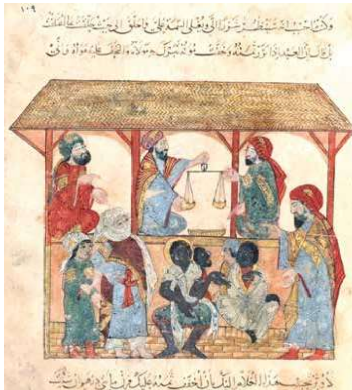
Not just a “white thing”: Perhaps the most prolific slave masters of the Middle Ages were the Arabs. Here, we see a painting of the sale of black Africans by Muslim slave traders in 13th-century Yemen.

While slavery was not abolished in all states of the United States until the passage of the 13th Amendment in 1865, the U.S. Constitution provided that Congress could ban the importation of slaves into the country in 1807 — which Congress did on March 2 at the urging of President Thomas Jefferson. Wilberforce's bill had passed about a week earlier.