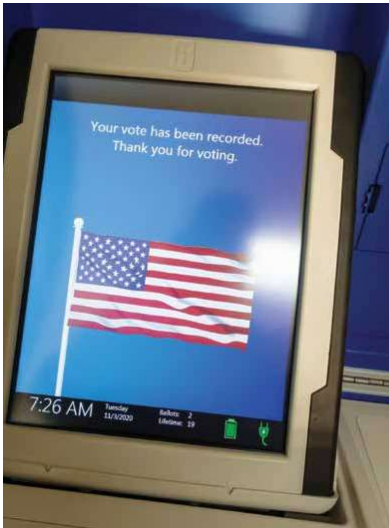
New, but not better: We need paper ballots, not electronic voting machines. And ballots should be counted at precinct levels, subject to public observation.

• Allow candidates to choose areas to audit the vote: In every election of substantial size, such as a