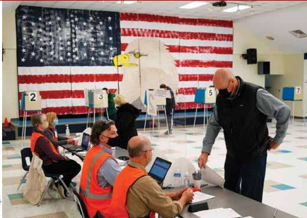
Lots of opportunity for fraud: A voter checks in on election day in Midlothian, Virginia. The lines were very short in many places because large numbers of voters had voted early or by absentee voting — unobserved by election officials.

• Publicly and immediately post precinct vote results: Precinct results must be publicly proclaimed, printed on paper, and posted publicly at the precinct voting location for at least seven days. They should also be posted on a website immediately and maintained on the website for at least two years so that researchers have ready availability to the results. In the present election, data analysis shows (backed by TV recordings) that vote counts for President Trump often actually went down as