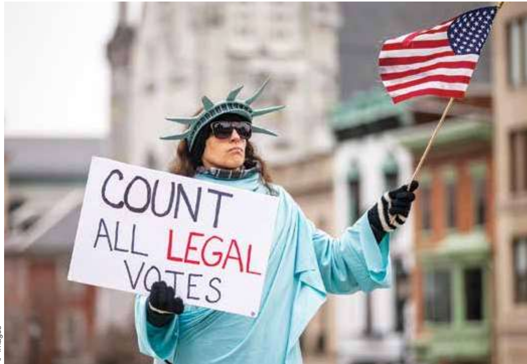
Rampant vote fraud noted: Protesters across the country rallied in support of President Trump under such slogans as "Count All Legal Votes" and "Stop the Steal."

In the present election, data analysis shows (backed by TV recordings) that vote counts for President Trump often actually went down as the night progressed.