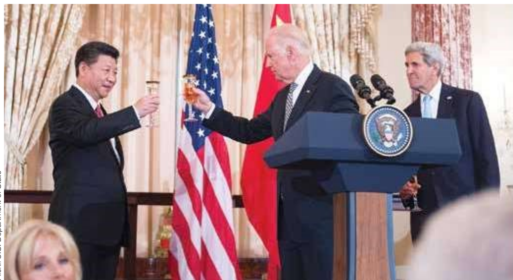
Beijing Joe: U.S. Vice President Joe Biden and Chinese President Xi Jinping toast during a state luncheon in 2015. Biden, who has longtime connections to the communist regime (including through his son Hunter), would resume Obama’s pro-Beijing policies.

• “Republicans for Biden”: Former Representative Constance Morella (R-Md.) has headlined fundraising events for “China Joe” Biden under the “Republicans for Biden” banner. Morella, who also endorsed and campaigned for Hillary Clinton in 2016, traveled to China on a trip organized by the China-United States Exchange Foundation (CUSEF),