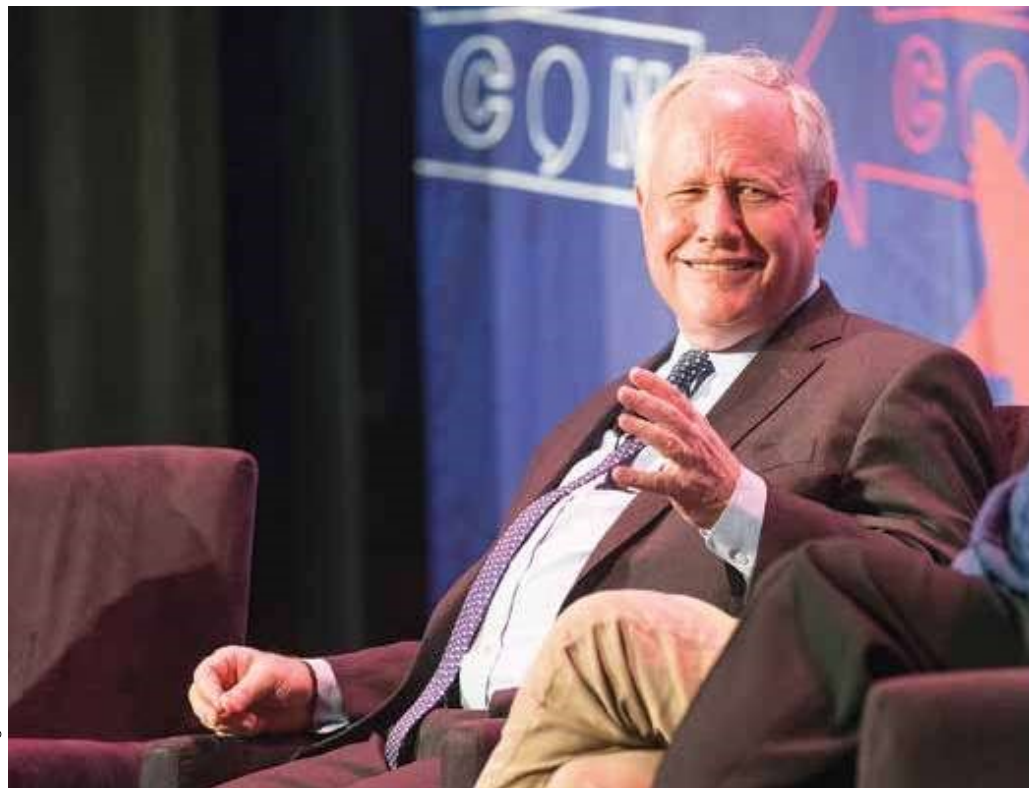
Neocon deceit: Irving Kristol, a former Trotskyite and the "godfather of neoconservatism," and his son, Bill Kristol (shown), have played pivotal roles in redefining and corrupting conservatism and the Republican Party.

The neocons, who fashion themselves as "intellectual conservatives," despise not only Trump and Trump supporters, but all of the ordinary, hardworking, common-sense conservatives of middle America, rural America, and small-town America. Like the Beltway Democratic Left, the neocons have nothing in common with the conservative residents of Red State "flyover country," or with the hapless inhabitants trapped inside