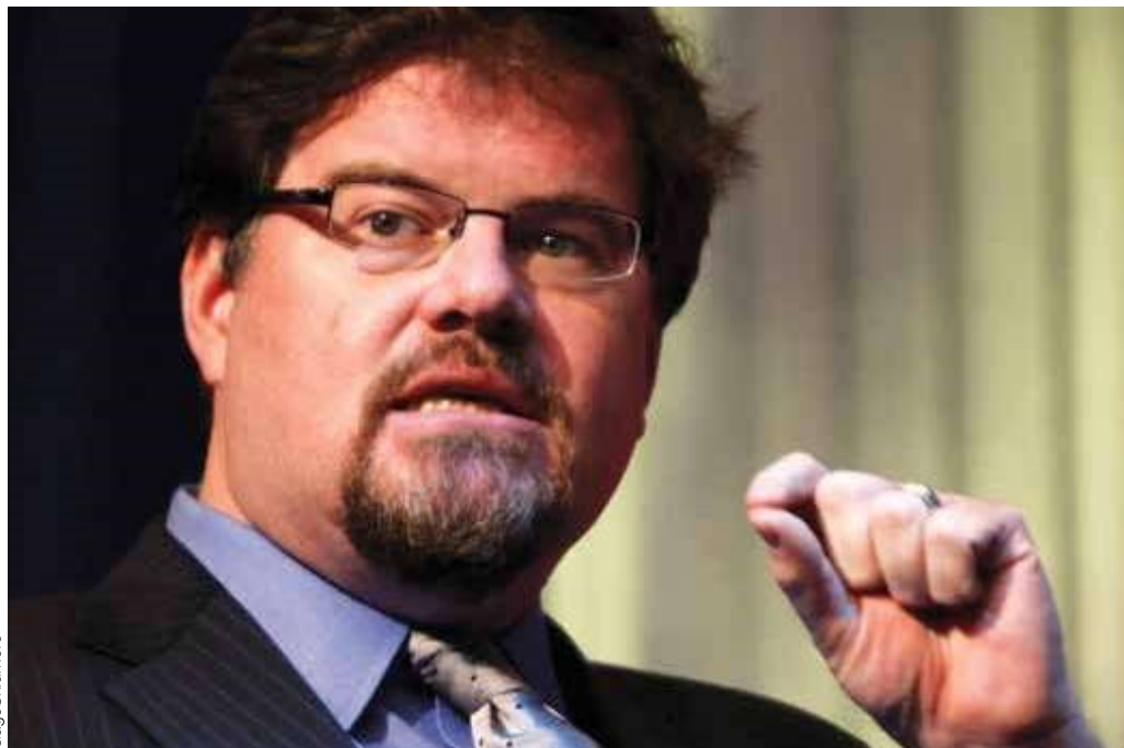
Pompous pundits: Jonah Goldberg, a former editor at National Review and a favorite “conservative” of the Fake News herd, now runs The Dispatch with neocon regulars Stephen F. Hayes and David French.

The late Robert Bartley, a longtime editor of the Wall Street Journal , was an ardent neocon internationalist who once declared, “I think the nation-state is finished.” A member of the globalist Council on Foreign Relations, he saw the end of America’s national sovereignty and inde-