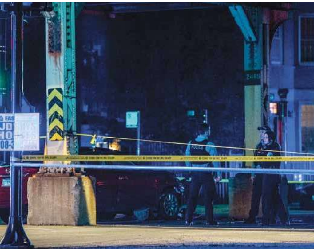
Criminals don't follow laws: With some of the strictest gun laws in the nation, Chicago has the highest gun-violence rates.